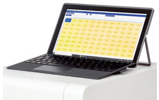
Figure 1: The Centro has a flat surface on its top, providing enough space to put down a laptop.