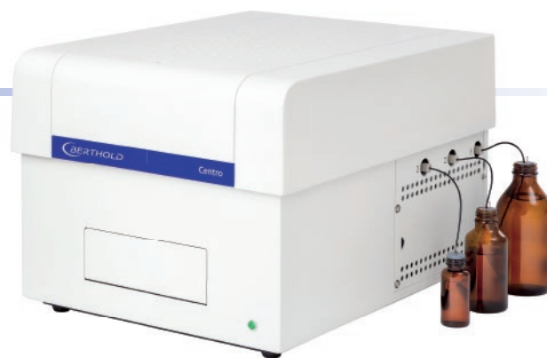
Figure 2: The optional injectors are integrated into the housing of the system to save precious bench space.