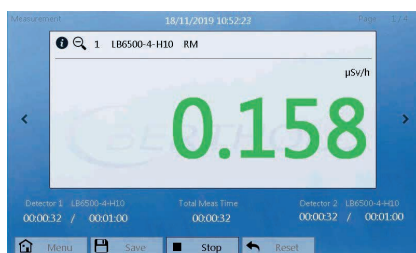
Figure 1: Flexible display options